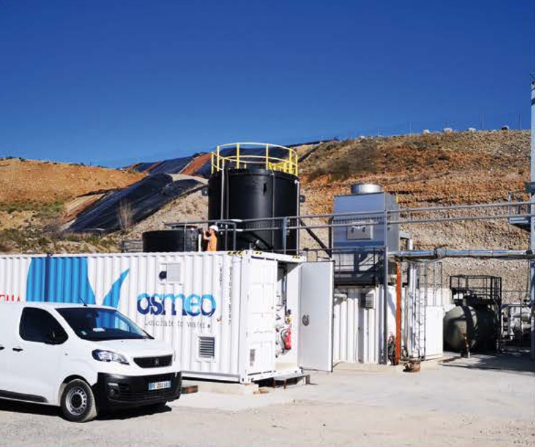
REVERSE OSMOSIS unit for leachate treatment