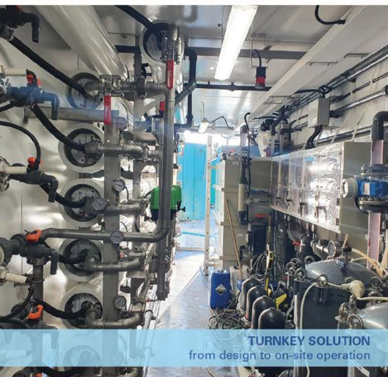
TURNKEY SOLUTION from design to on-site operation